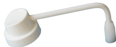
Spray head with bent extension pipe + oral nozzle 85 mm Art. No. 119.990.012